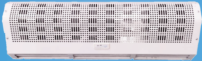
Model MAS-900 H - MAS-1200 H