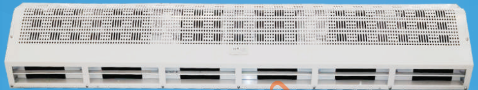
Model MAS-1500 H - MAS-1800 H